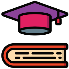
High School Diploma

Individuals Position Themselves for Opportunities