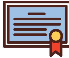
College - BA/BA (4 Year Degree)